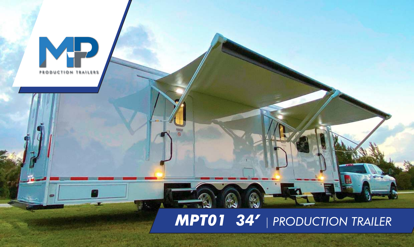
MPT01 34' | PRODUCTION TRAILER