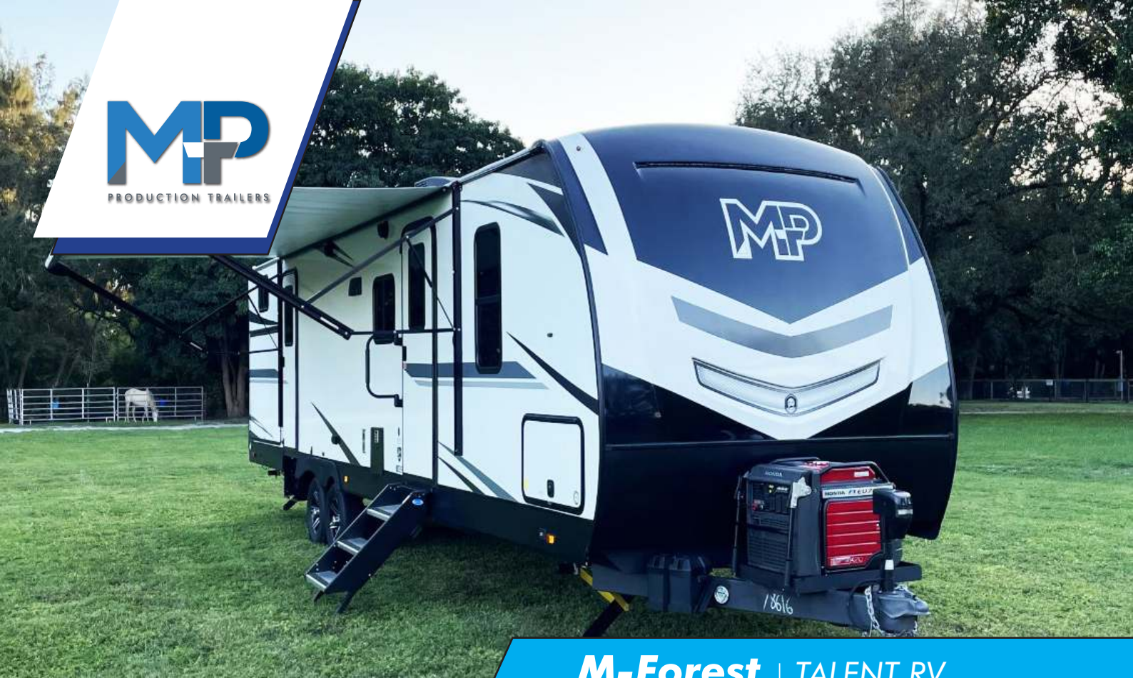
M-Forest | TALENT RV